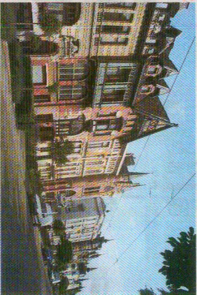
Rows of art nouveau houses at the Cogy-Osy Lei are a sight to behold.

We were welcomed to their very cozy haven where several rooms and a studio apartment on Draksstraat Street have a