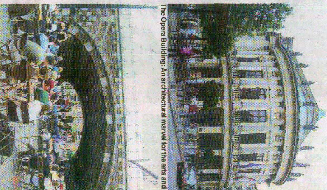
The Opera Building: An architectural marvel for the arts and