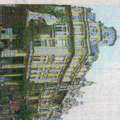
Green plaits in the historic h Antwerp where cafes, restaura shops abound.

The National Bank spectacular view of the city. Over a hearty breakfast of freshly cooked eggs, cheeses, jams, breads, orange juice and robust coffee graciously prepared by this dynamic duo, we exchanged stories of home as well as their experiences living in Antwerp.