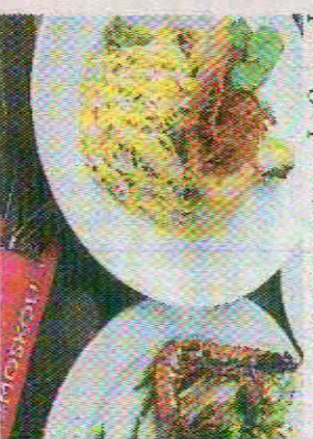
A hearty meal of pasta and prawns at Brasseri Moskou

Each home has distinctive crest linguish the profession of the c Most of the edifices of grandcar are by a variety of professionals such yers, doctors, journalists, philo writers, poets, designers, artists, s photographers, architects and the