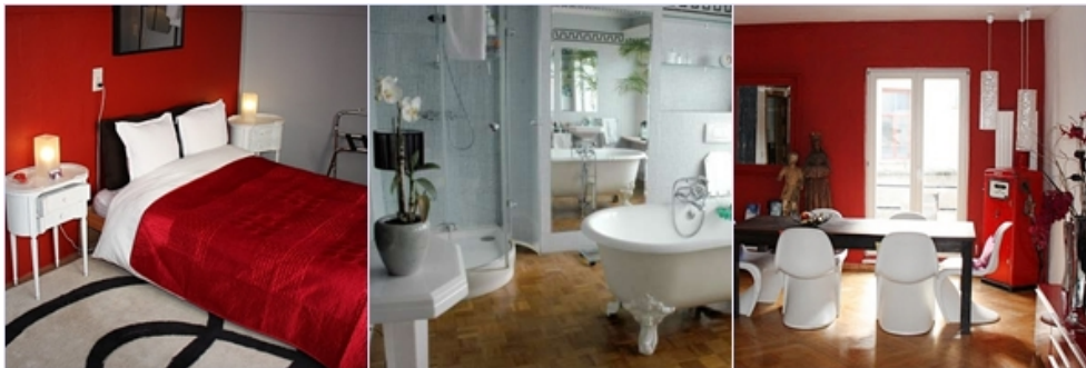
The stylish surroundings at Mabuhay Bed and Breakfast

Joining Milan among international fashion capitals on the New York Times's "41 Places to Go in 2011", Antwerp isn't exactly the kind of place where an independent traveler is likely to fill out his or her wardrobe. It does, however, offer browsing pleasures galore for frugal fashionistas. It also hosts several inexpensive lodgings that manage to offer up stylish design without the high price tag. At Antwerp Backpackers Hostel , you'll pay $28 for a dorm bed in a space that thankfully bears little resemblance to the stereotypical hostel image. More conveniently located to all the boutiques and galleries mentioned by the Times is Hotel Scheldezicht , where $68 gets you a private single room, and $95 a double.